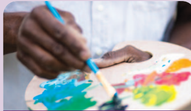
STIMULATING PROGRAMMING TO ENGAGE MIND AND BODY