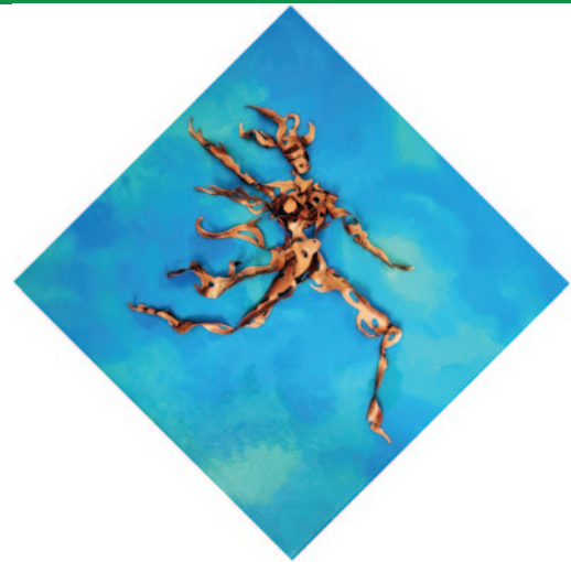
Examples of Fred's 3-D paintings are shown above and below.

While attending college, Fred enjoyed photography and