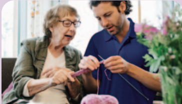
SPECIALLY TRAINED CARE TEAM DELIVERING PERSONALIZED CARE

Benchmark creates connections and meaningful experiences for individuals with Alzheimer’s and other forms of dementia. We cultivate a sense of community and deliver personalized care with passion.