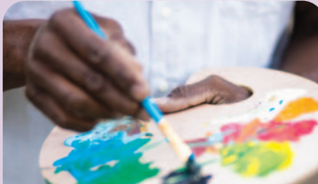
STIMULATING PROGRAMMING TO ENGAGE MIND AND BODY