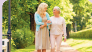
THOUGHTFULLY DESIGNED LIVING ENVIRONMENTS